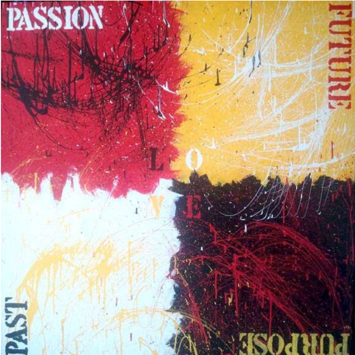
Baird, Ian. Passion and Purpose . 2012. Acrylic on panel board, 48" x48".