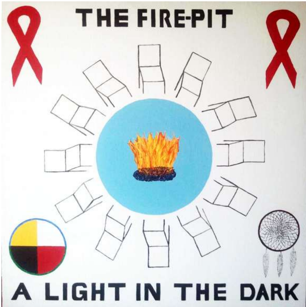
Bozoki, Johnny. Giving Back . 2012. Acrylic on panel board, 46" x46".