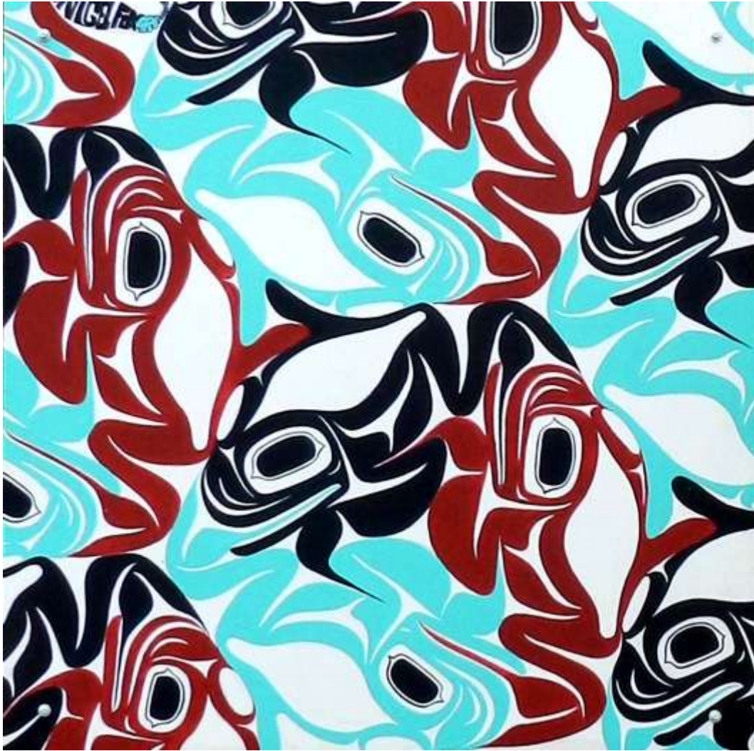
Fox, Nigel. Frogs . 2012. Acrylic on panel board, 46" x46".