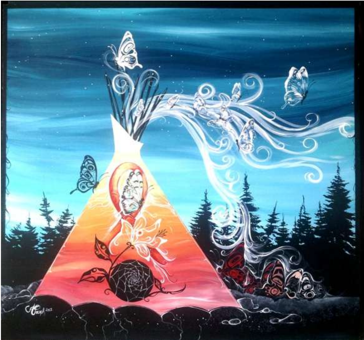
Joseph, Carla. Humming Bear . 2012. Acrylic on panel board, 46" x 45".