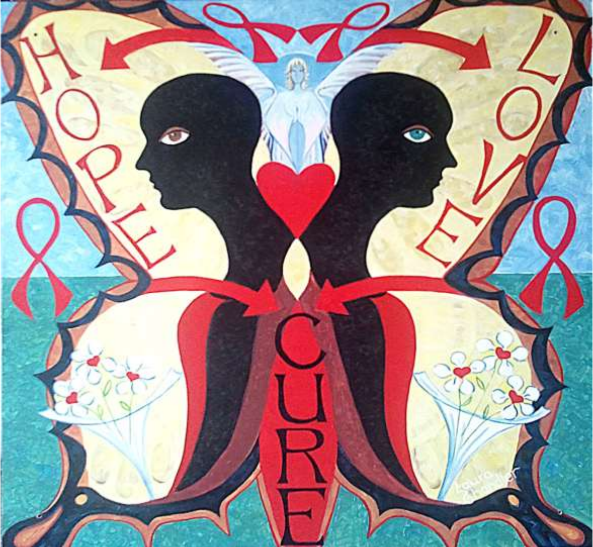
Chandler, Laura. Blue Angel . 2012. Acrylic on panel board, 46" x46".