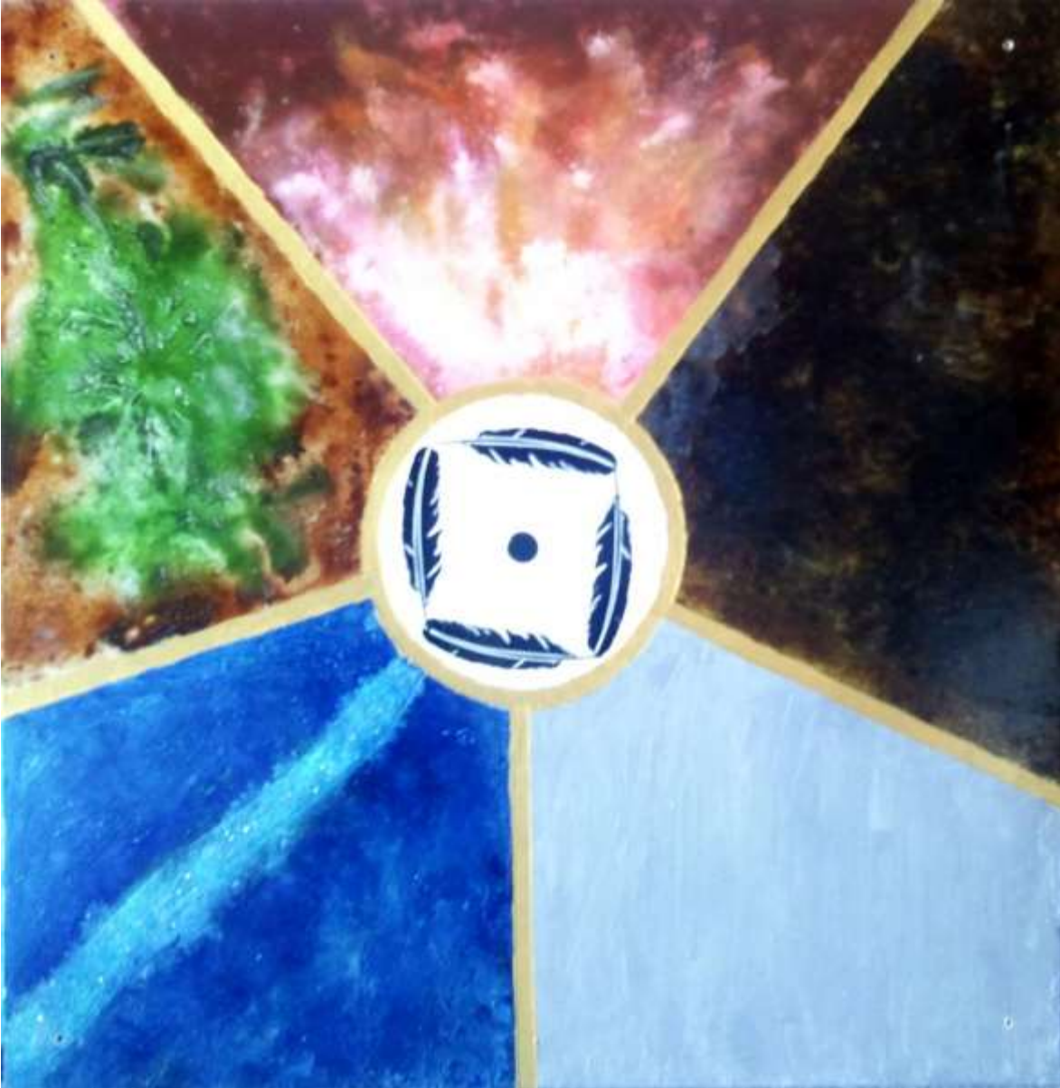
Hirst, Alison. Love in Five Elements . 2012. Concrete overlay coloured with Acrylic on panel board, 46" x46".