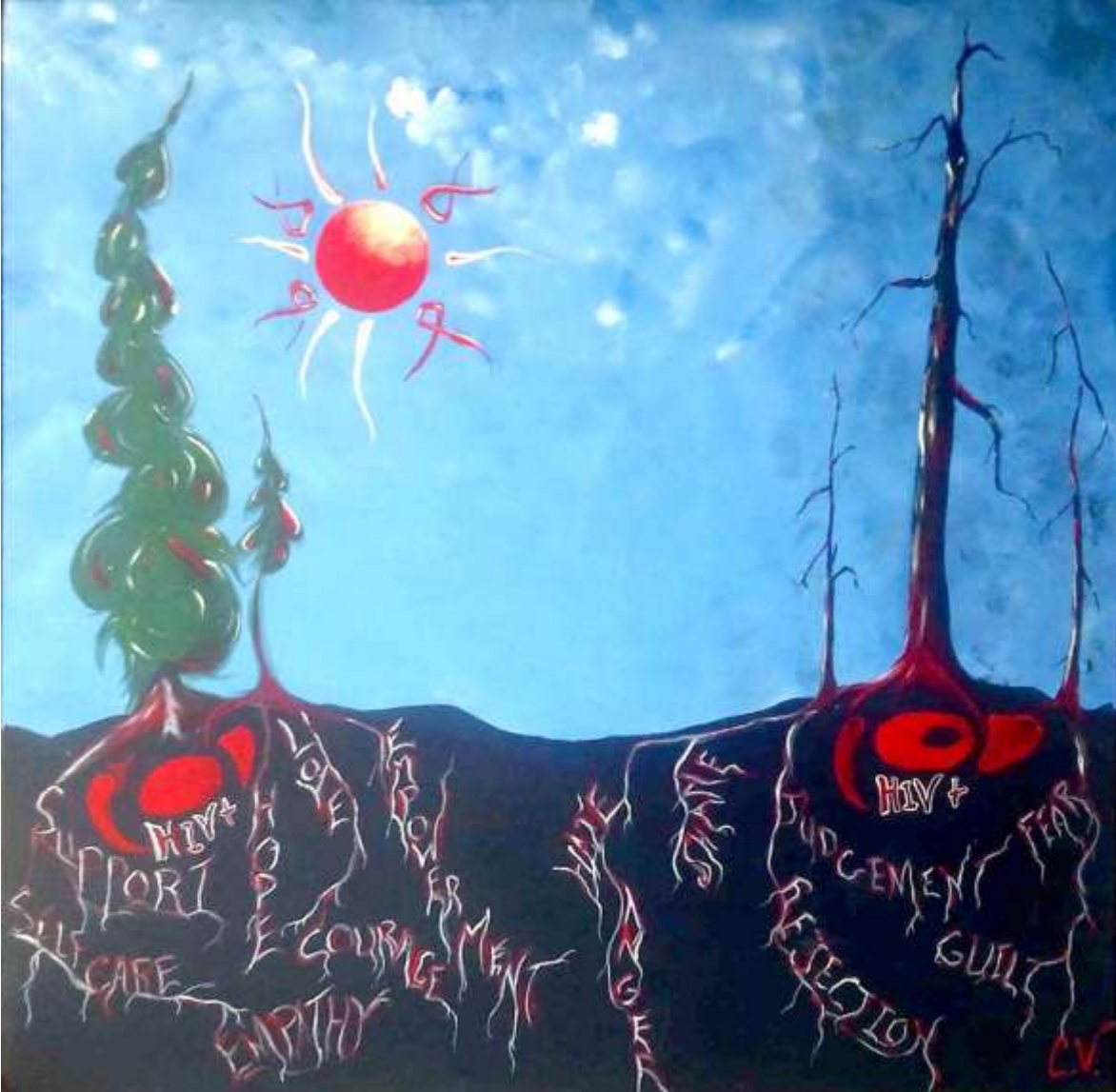
Vagt, Callista. The Truth of Roots . 2012. Acrylic on panel board, 46" x46".