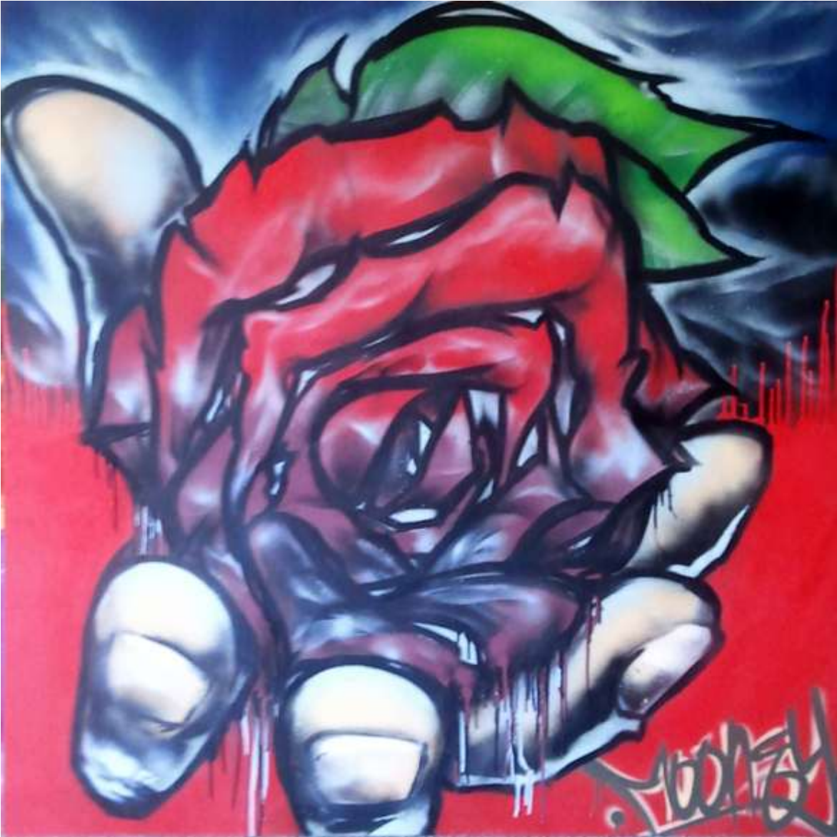
Mooney, Andrew. Progress . 2012. Spray Paint on panel board, 46" x46".