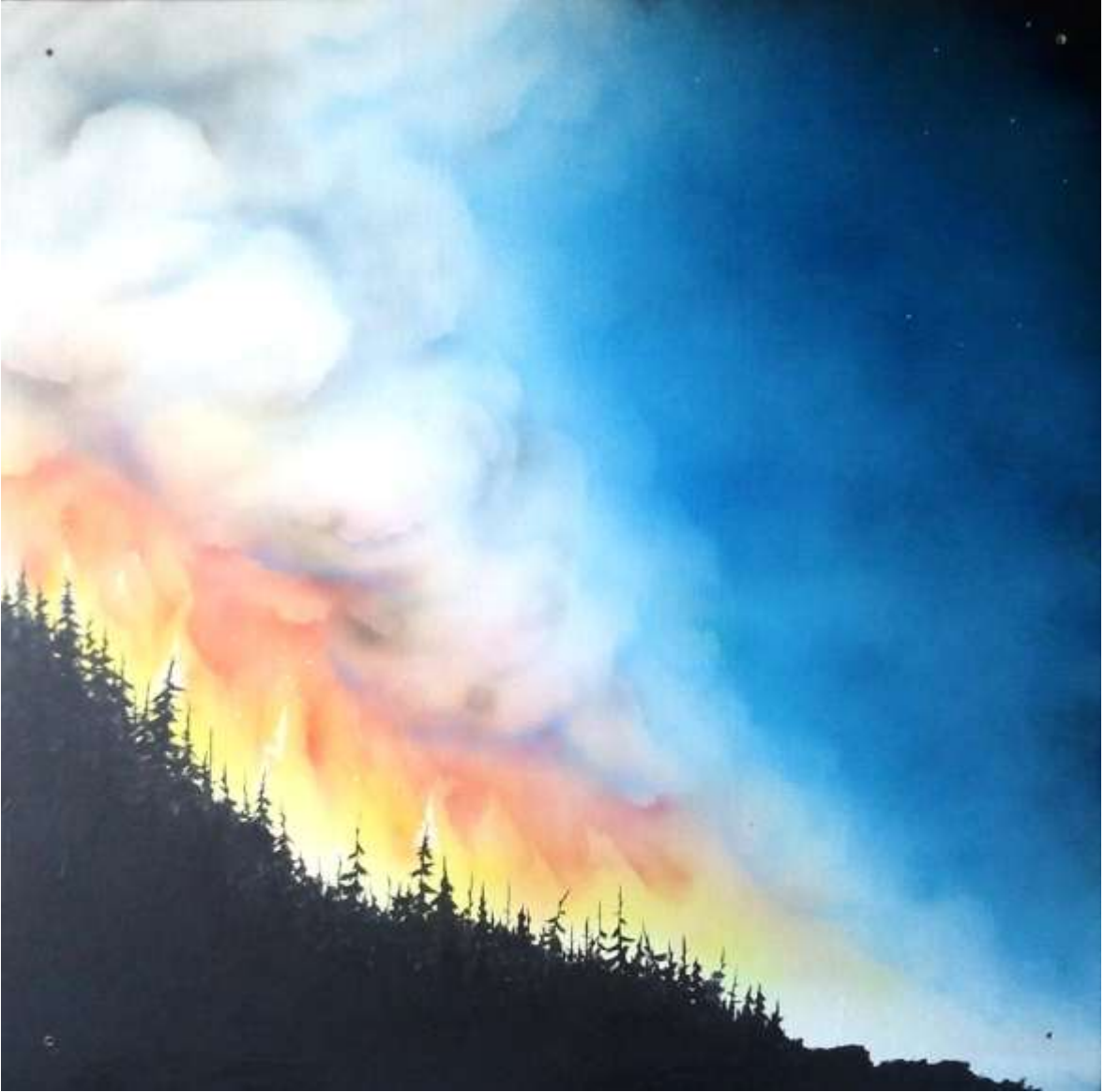
Donahue, Chad. One Mistake . 2012. Airbrush paint on panel board, 46" x 46".